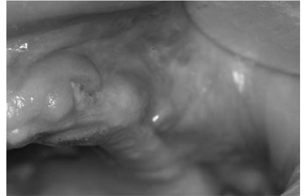
Figure 5. Post-surgical view of the left maxilla (R.C.) 3 months after the treatment.