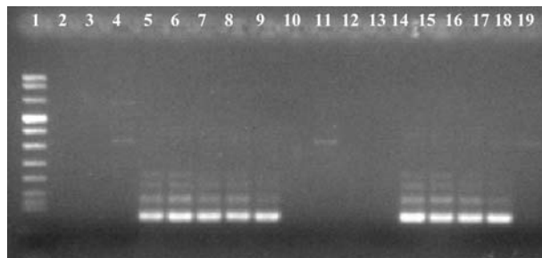
Figure 1. Lane 1: molecular weight marker (1,114-19 bp); lane 2: Extraction negative control (double distilled sterile water); lane 3: DNA extracted from MEM medium without Toxoplasma gondii ; lane 4: DNA extracted from peripheral blood without Toxoplasma gondii ; lane 5 to 12: Toxoplasma gondii DNA from pure culture in MEM medium ten-fold diluted from 1.2 \times 10^7 tachyzoites/ml to 1.2 tachyzoites/ml; lane 13: Extraction negative control (double distilled sterile water); lane 14 to 19: Toxoplasma gondii DNA from peripheral blood ten-fold diluted from 1.2 \times 10^7 tachyzoites/ml to 12 tachyzoites/ml

To control the course of extraction and check for PCR inhibitors, a β-actin gene (Applied Biosystems) was amplified by a TaqMan-based Real-time PCR at the same reaction conditions used for the 18S rDNA