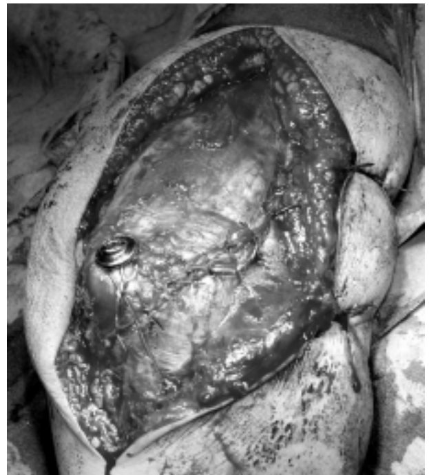
Figure 4. The final result of the closure using the closing screw-washer and cerclage (tension band, also called zuggurtung or haubannage) allows an early and secure elbow mobilization. All risks have been get through.

ribbons and Kocher pincers. At this point the red light becomes yellow and the attention is focused on the olecranon osteotomy, that represents the “yellow light”.