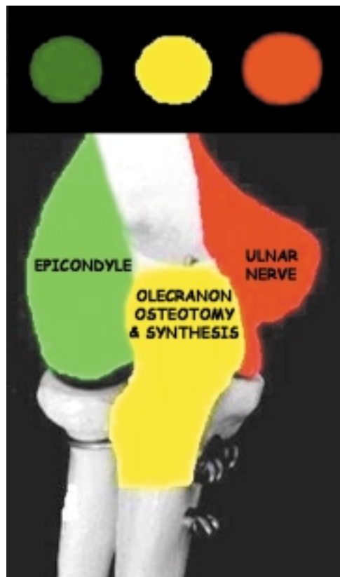
Figure 3. The risks are classified with 3-colours traffic lights model: red light for the ulnar nerve, yellow light for the olecranon osteotomy-osteosynthesis and green light for the lateral side of the joint.