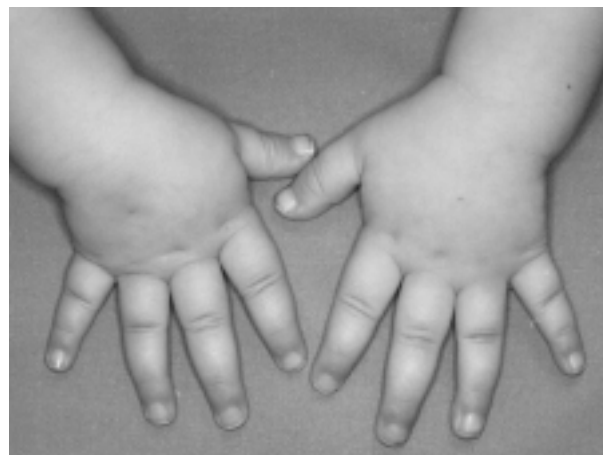
Figure 2. Hand

The skeletal survey showed normal bone age, brachydactyly, short metacarpals, especially 4 th and 5 th and osteoporosis. Cranial CT scan demonstrated basal ganglion calcification. We considered these clinical findings sufficient for the diagnosis of Albright's hereditary osteodystrophy (Pseudohypoparathyroidism ty-