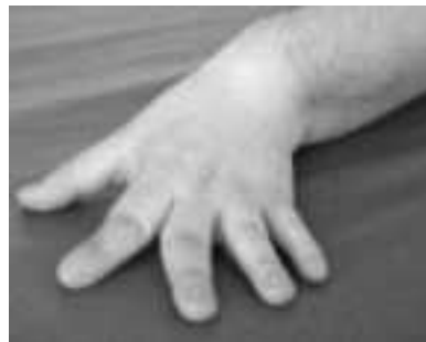
Figure 1b. Left hand

Bilateral coxa vara was present. Lower limbs were asymmetrical, since right femur was 2 cm shorter than left one. Femur/tibia ratio was abnormal. Left hand showed angular deformities of 2 nd and 3 rd axes (Figure 1b).