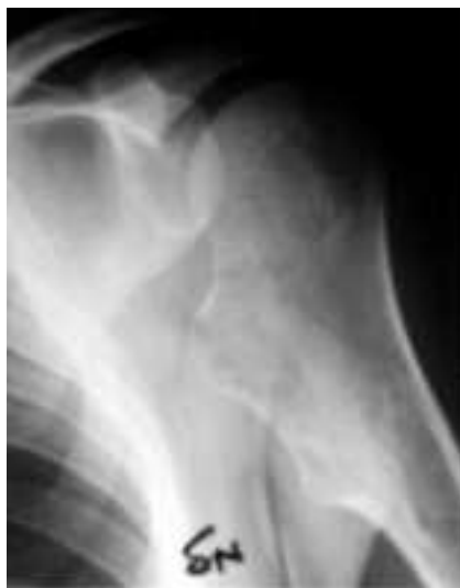
Figure 2b. Left shoulder