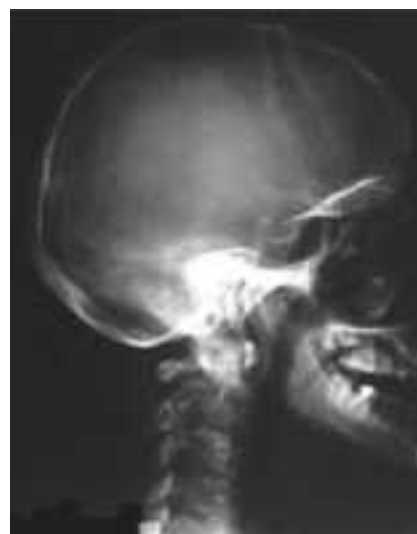
Figure 3. Skull