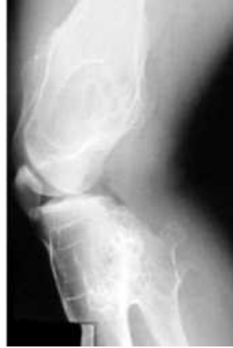
Figure 5c. Left knee

Furthermore the range of motion at discharge was better for all joints than at outset. In particular right shoulder abduction became normal.