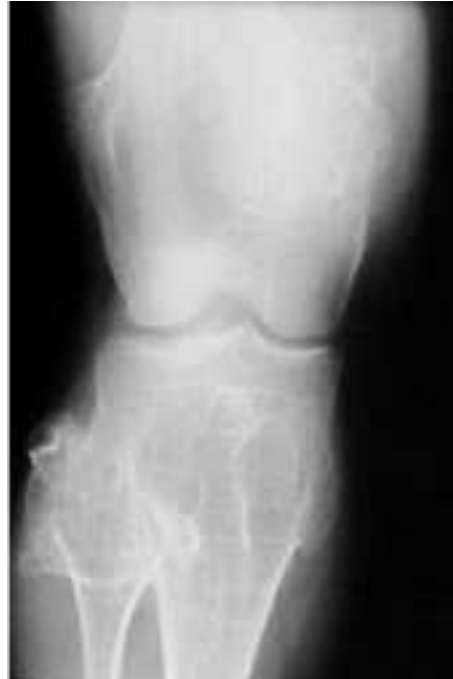
Figure 5b. Right knee