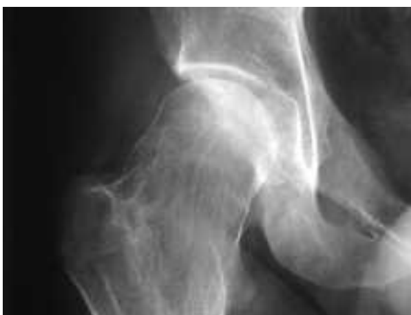
Figure 4a. Right hip