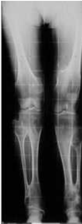
Figure 5a. Lower limbs