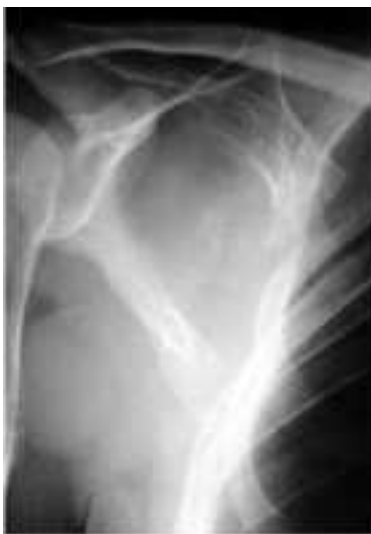
Figure 2a. Right shoulder