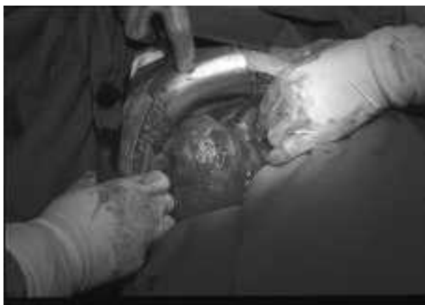
Figure 1. Immediately singling out of the mass after laparotomy

At the histological macroscopic examination the mass measured 11 centimetres of diameter with a weight of 480 grams, while at the histological microscopic examination this mass was referable to a carcinomatous not much differentiated process with a vaguely "cordoned" structure compatible with