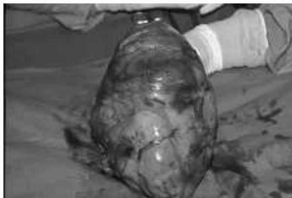
Figure 3. The removed giant metastasis

metastatic lymph-nodal relapse in the mesenteric tissue from mammary gland's carcinoma; also the lymph-nodes founded in peri-intestinal area seemed totally substituted by the above-named neoplastic tissue; but the mucosa of the jejunal specimen didn't show any alteration of neoplastic nature.